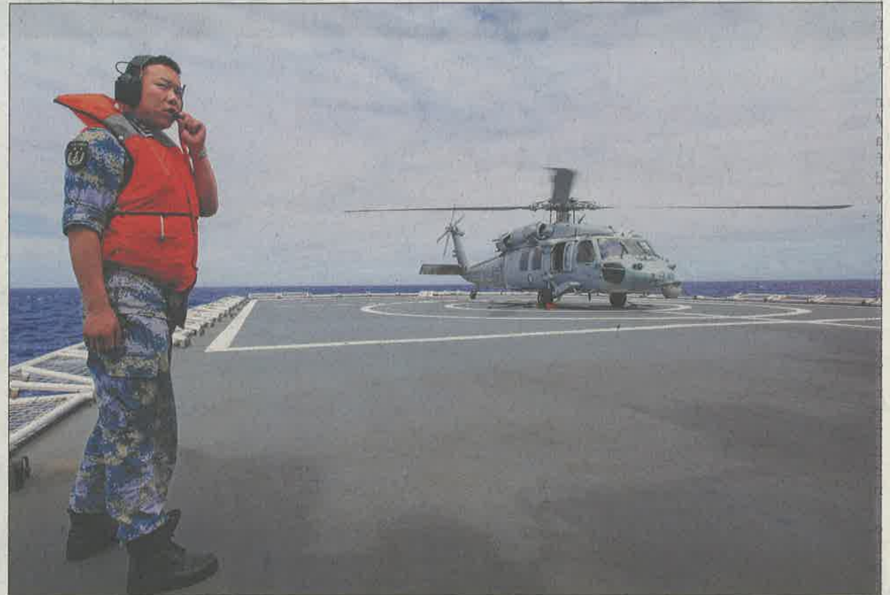
A deck chief of the PLA ship Peace Ark speaking on his radio as a US Navy UH60 Seahawk prepares to take off from the Chinese vessel during last month's multi-national military exercise - Rimpac - in Hawaii.

The book is available at Kinokuniya at $32.60 before GST.