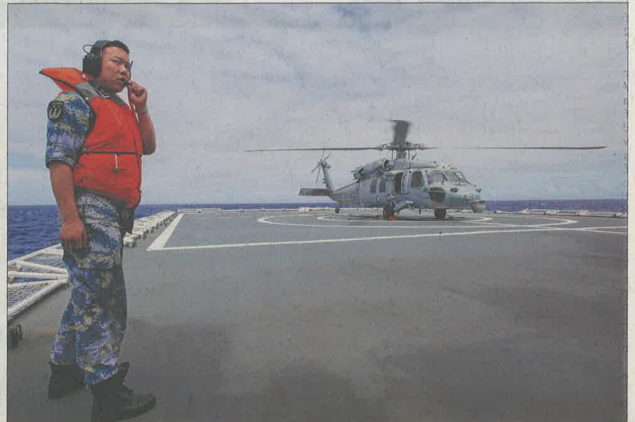
A deck chief of the PLA ship Peace Ark speaking on his radio as a US Navy UH60 Seahawk prepares to take off from the Chinese vessel during last month's multi-national military exercise - Rimpac - in Hawaii.

The book is available at Kinokuniya at $32.60 before GST.