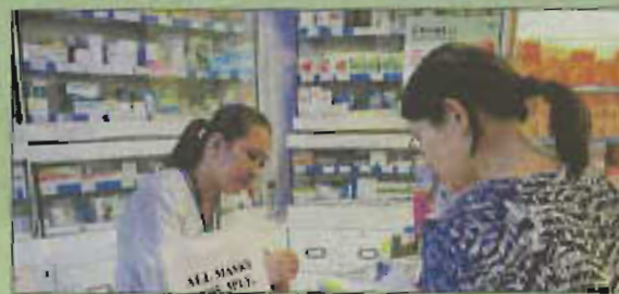
ST PHOTO: DESMOND WEE